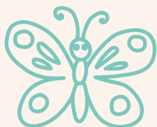
BUTTERFLIES Mobile Infants