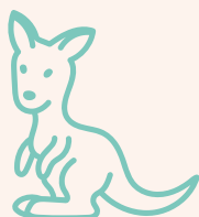
KANGAROOS Three Year Olds