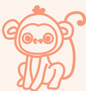
MONKEYS Two Year Olds