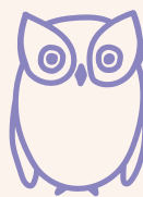
OWLS Four-Five Year Olds

We utilize a mixture of a purchased curriculum and teacher's knowledge to create lesson plans for each classroom. We offer a 3 year old preschool program and a 4-5 year old pre-k program that includes Kindergarten Enrichment. By attending Precious Angels, your child will be well prepared for Kindergarten in all areas of development, including social/emotional skills, letter recognition, writing, number recognition, physical development, fine and gross motor skills.