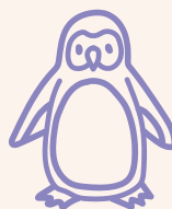
PENGUINS One Year Olds